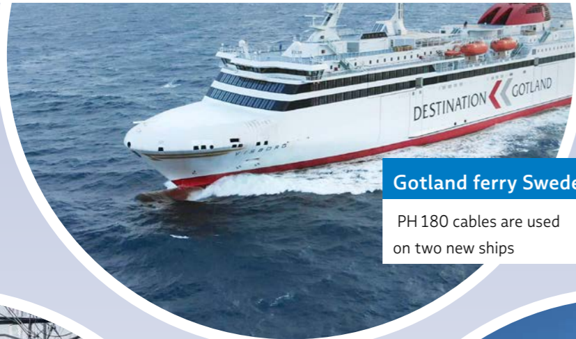
Gotland ferry Sweden PH 180 cables are used on two new ships