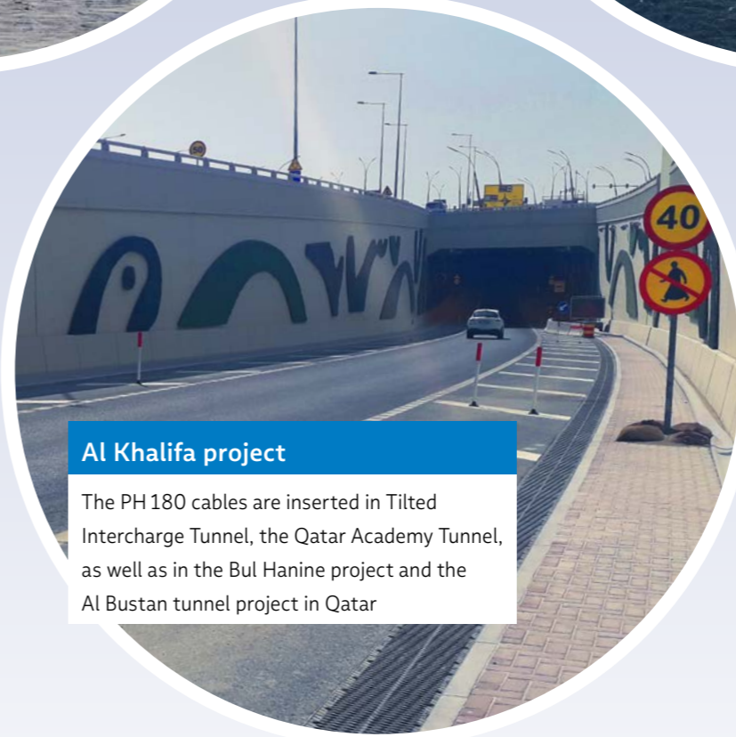
Al Khalifa project The PH 180 cables are inserted in Tilted Interchange Tunnel, the Qatar Academy Tunnel, as well as in the Bul Hanine project and the Al Bustan tunnel project in Qatar