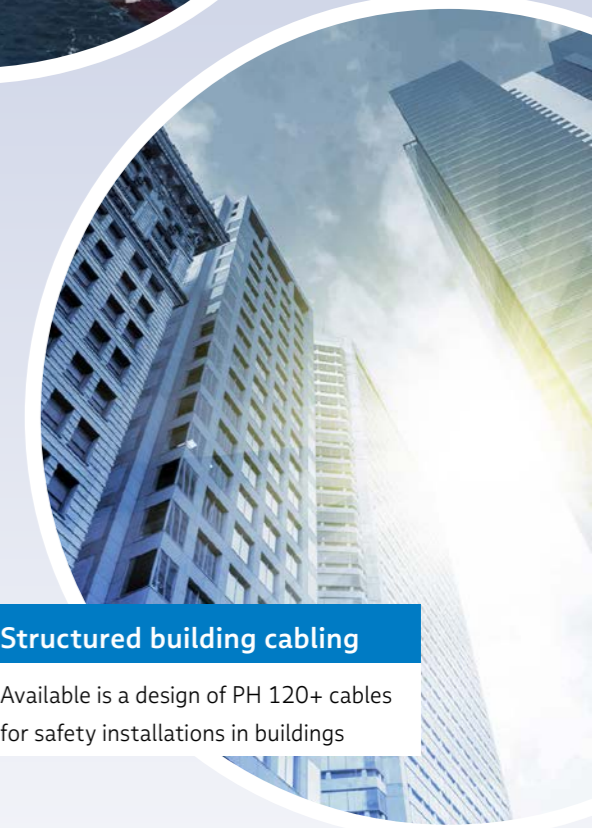
Structured building cabling Available is a design of PH 120+ cables for safety installations in buildings