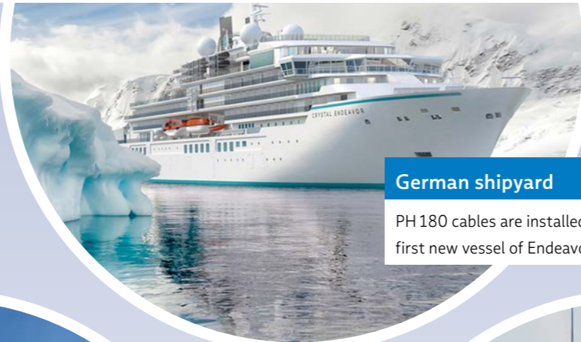
German shipyard PH 180 cables are installed on first new vessel of Endeavor class