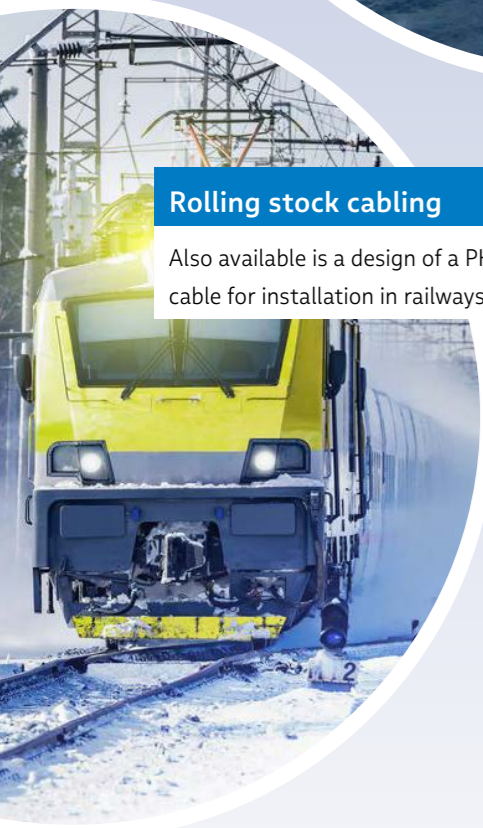
Rolling stock cabling Also available is a design of a PH 180 cable for installation in railways