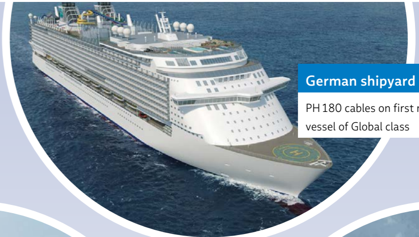
German shipyard PH 180 cables on first new vessel of Global class