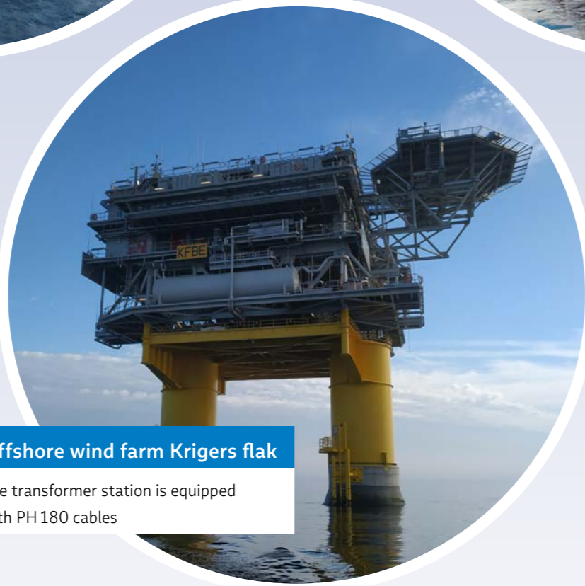
Offshore wind farm Krigers flak The transformer station is equipped with PH 180 cables