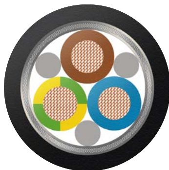
Marine deck signal light spiral cable