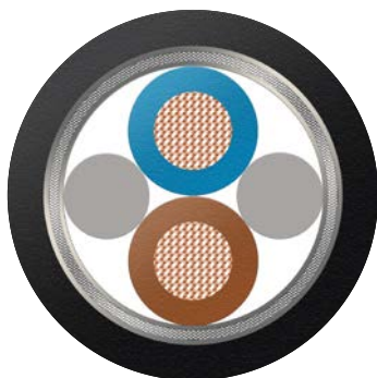
Marine deck signal light spiral cable