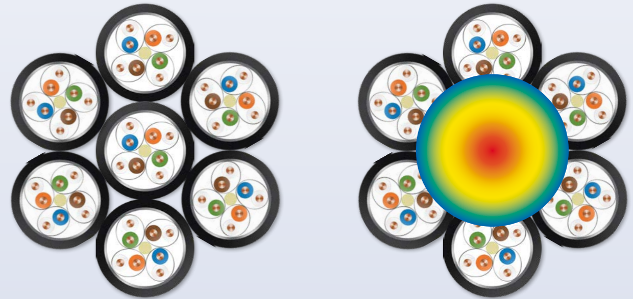
Example of application for an Ethernet cable bundle with PoE use with resulting heat generation

The right cable design makes a crucial contribution to minimising heating of the cable.